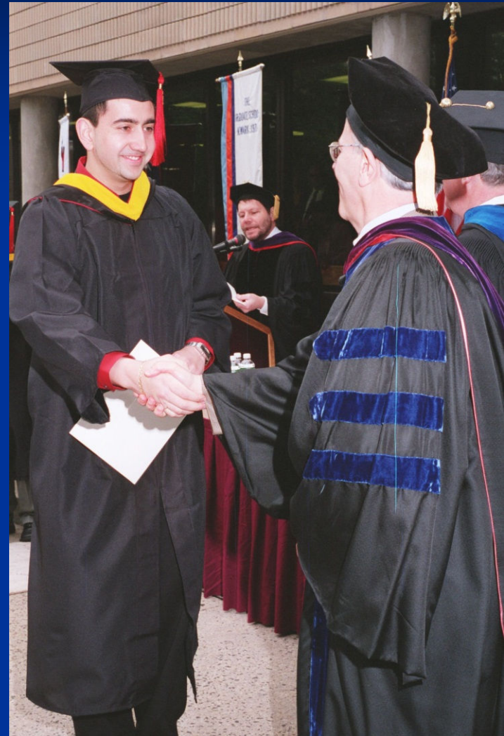
A graduate receives his diploma