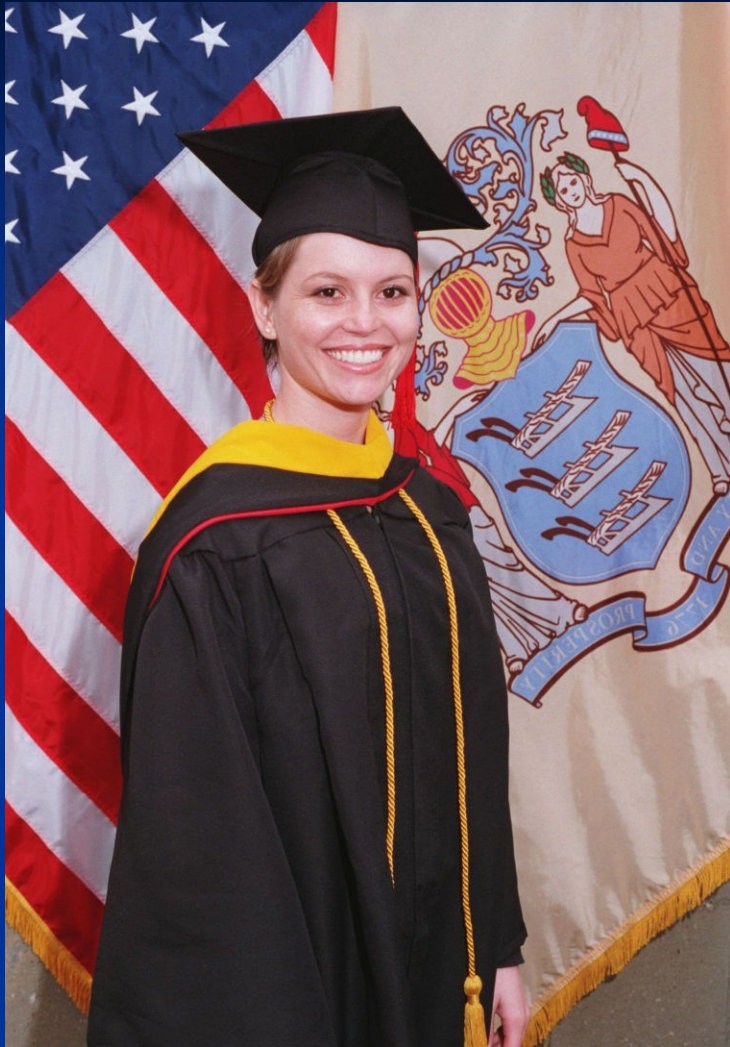
A graduate poses at the bottom of the ramp